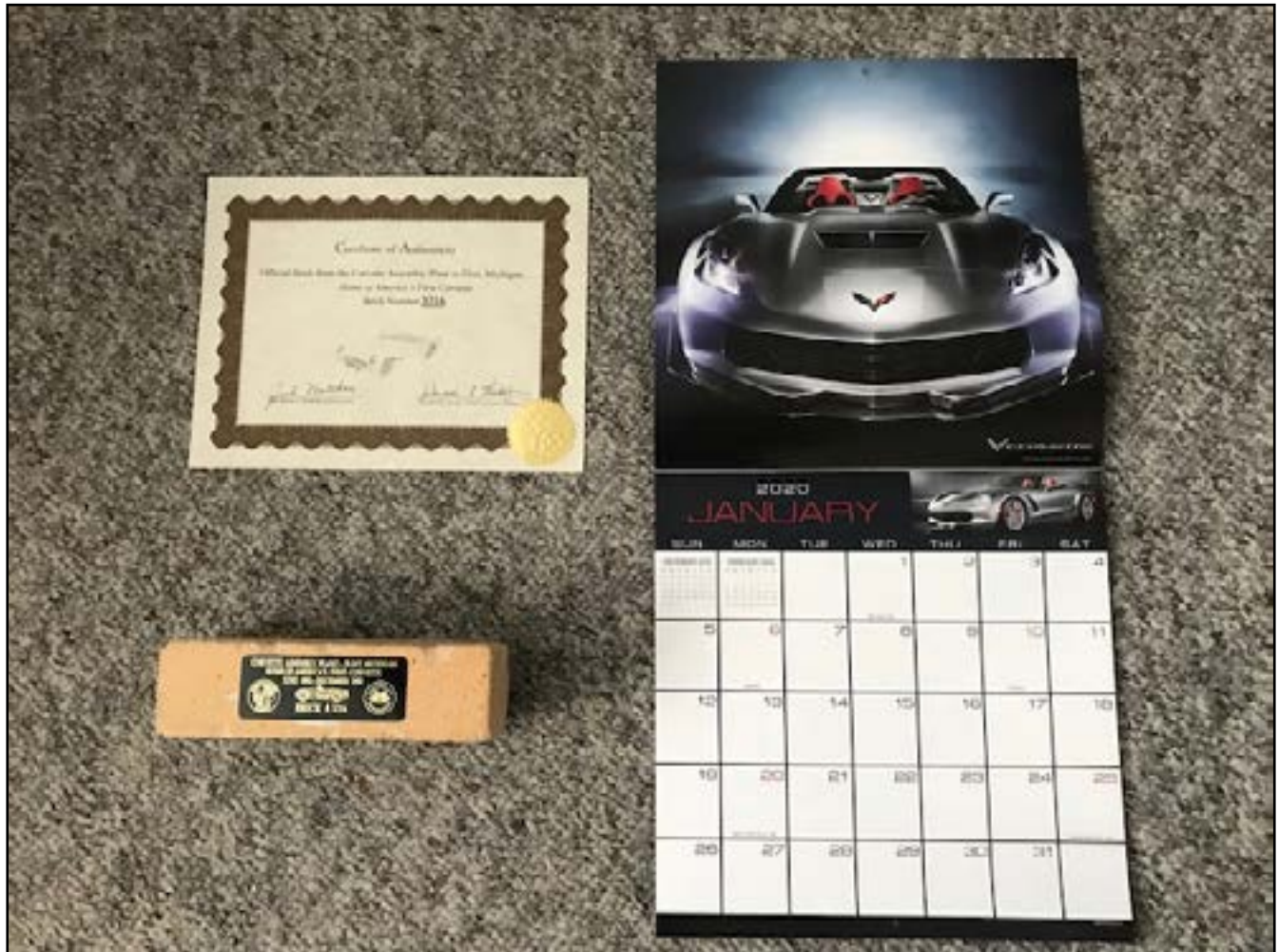
Flint Brick & 2020 Corvette Calander