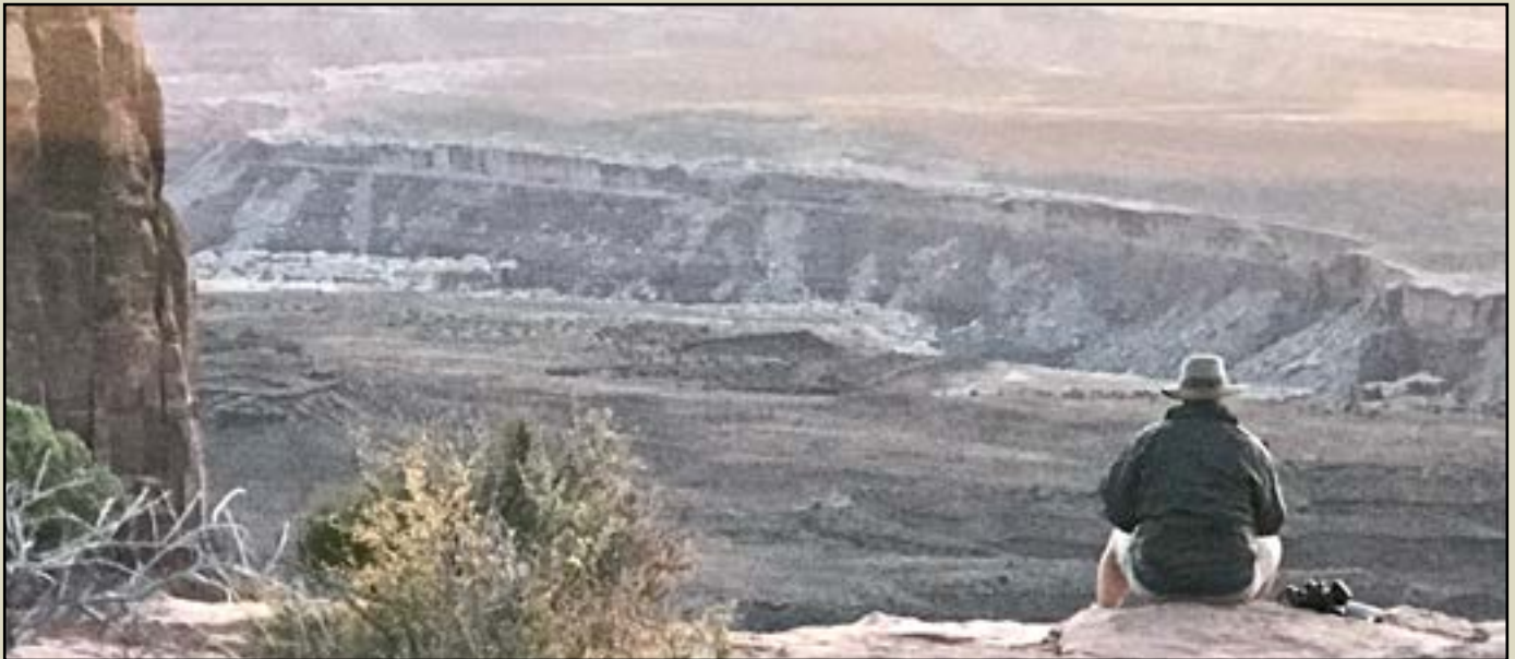
Zion National Park