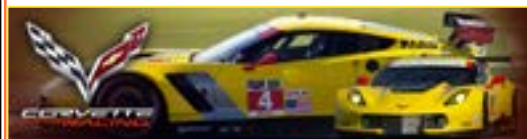
Corvette Racing 2019 IMSA Series Race

As always, please watch our club website for updates and new event listings.