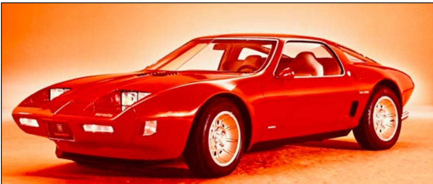
XP-987 GT Corvette 2-Rotor