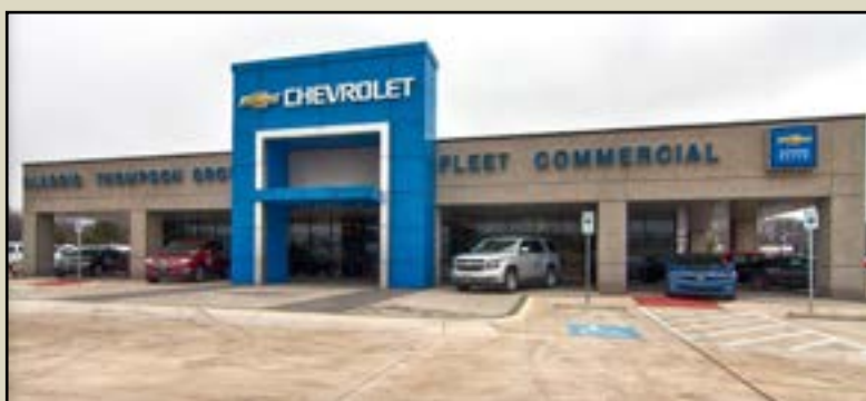
C8 On Tour at The Thompson Group at Classic Chevrolet