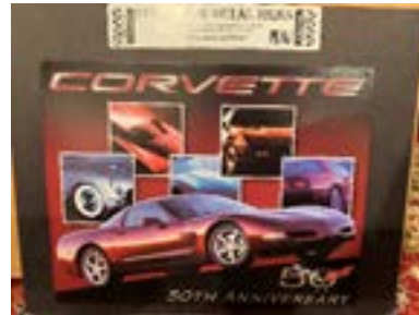
2003 Corvette 50th Anniversary Tin Sign

C5 and C6 Show N Go Front License plate mount bracket. Corvette Central $44.95 Now $30.00