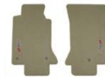
03 FLOOR MATS - SHALE WITH C5 50TH ANNIVERSARY LOGO - LLOYD DESIGN (Never Used, Still in Box)

Part #: 656-914 New $19.99 Never Used Now $15.00