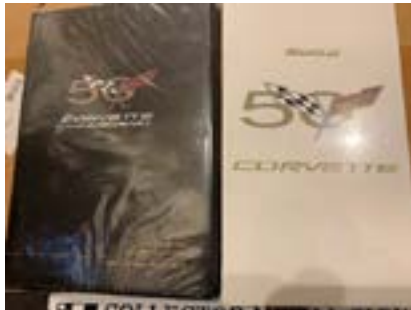
Original VHS Cassette & DVD 50 th Anniversary Corvette New in original shrink wrap. Make an offer.