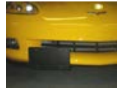
STOW-N-GO License Mount (New in original box)

Sell your Corvette here in the Classified Ads section of the Newsletter and make room for that new Corvette you al- ways wanted!