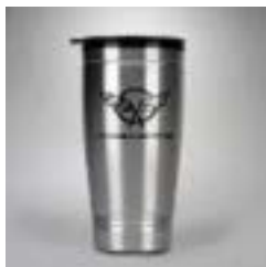
Stainless Travel Mug with C5 Logo (Never Used with pouch)

Part #: 605-523 Was $13.99 each, Now $9.99 each 2 Available