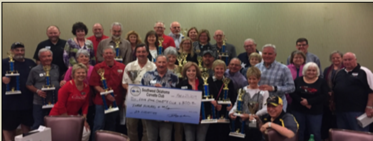
Attending LSCC Members Group Picture