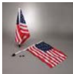
Parade Flags (Slightly Used)

Part #: 605-523 Was $13.99 each, Now $9.99 each 2 Available