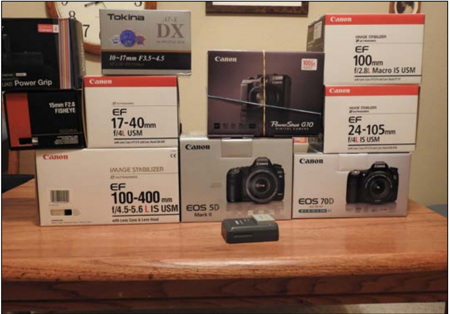
Photo Equipment for Sale