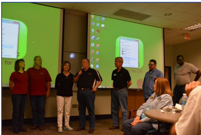
New members at April meeting

Information on local DFW area car show or cruise in event plans will be posted in the members only Forum Pages under Cruise Nights . There you can make a post about an upcoming event that you plan to attend or comment on attending other events that may be already posted. Remember to allow plenty of lead time to get the relevant information out to our other club members so they can join up with you!